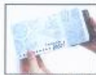
Seal box & case also available